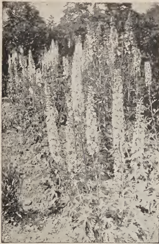
Delphinium, Blackmore &amp; Langdon Hybrids